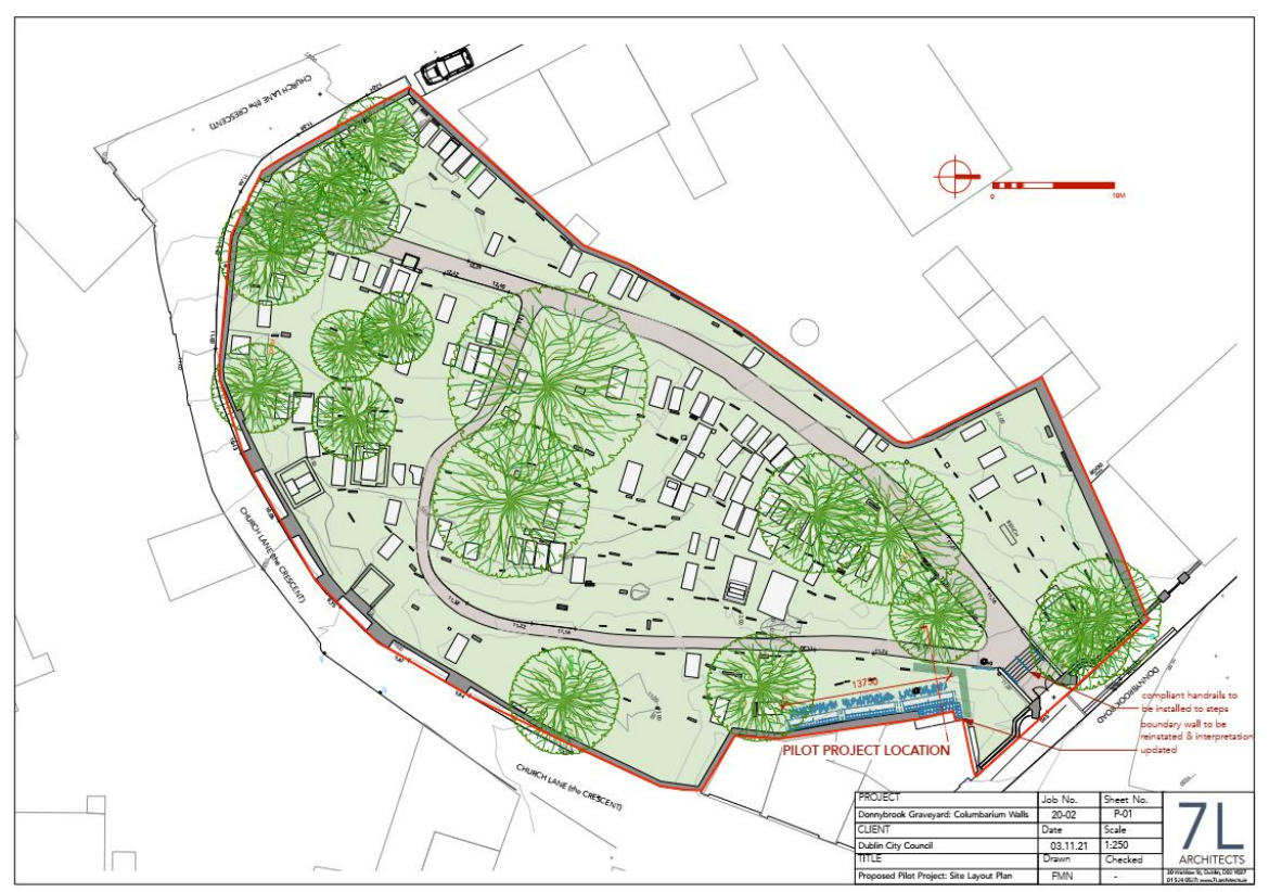
Location Plan of 3 no. Columbarium Walls (in context of the whole graveyard)

The future intention is to provide Columbarium Walls at St. John the Baptist, in Clontarf and Bluebell Cemetery.